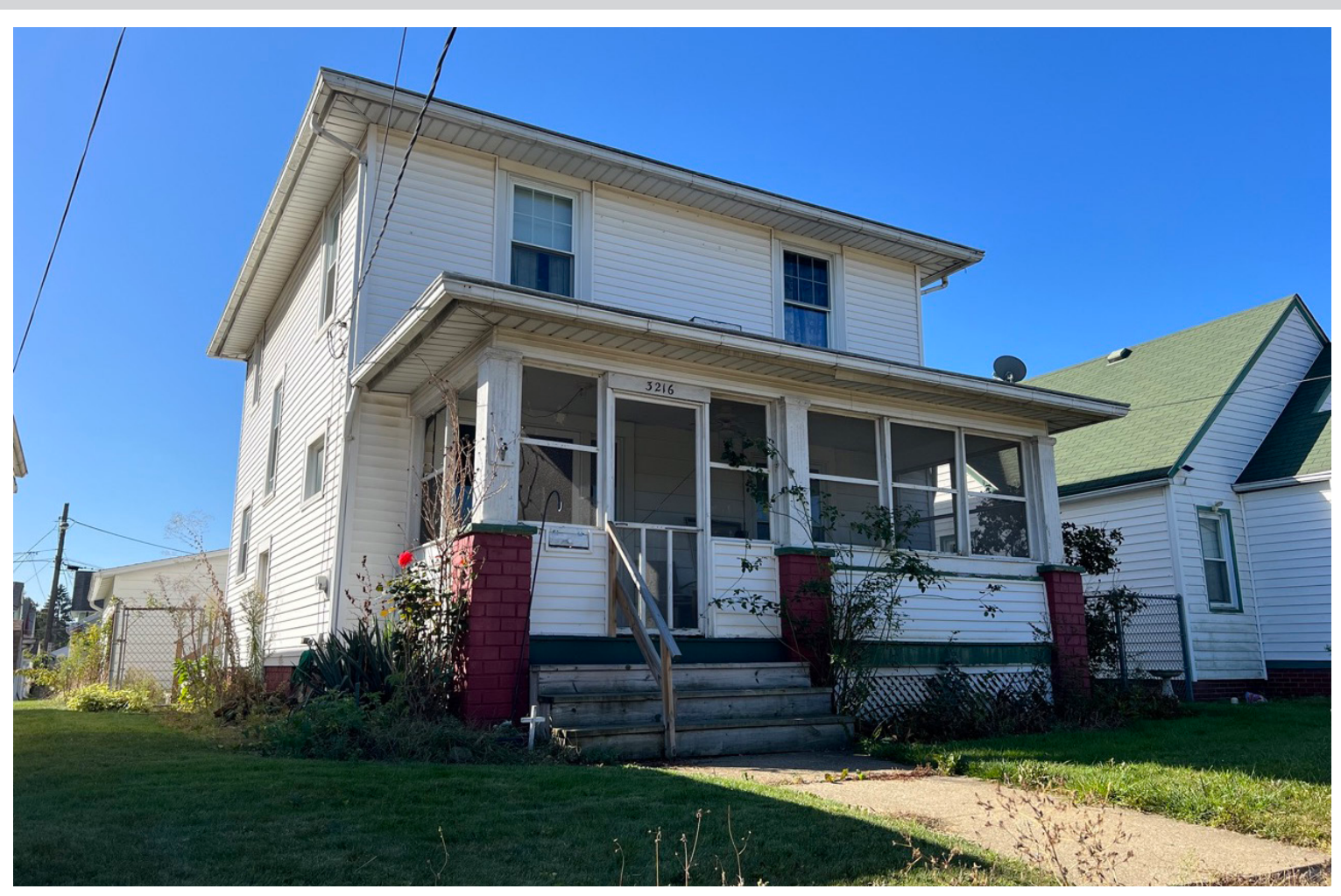
Information is believed to be accurate but not guaranteed. KIKO Auctioneers

Directions: From Tuscarawas St., take Maryland Ave. south, then right on 6th St. Home will be on left side. Garage access in back on Engle Pl.